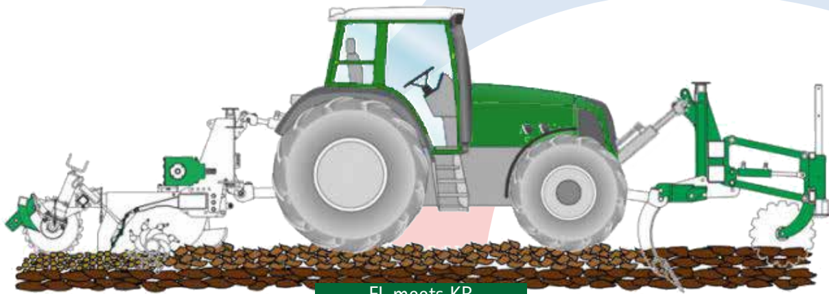
FL meets KR